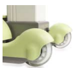
Wheels for portability.