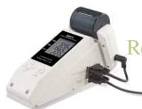
Remote control unit (optional)

BSM370 2010/03/15/10:27:34 • Height 156.5 cm • Weight 54.5 kg • BMI 22.3 kg/m 2 BIOSPACE